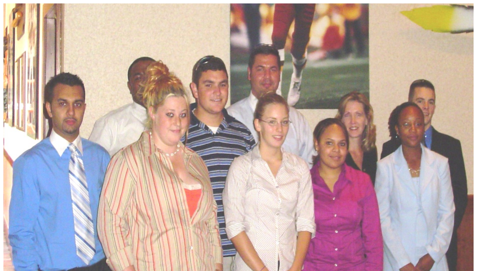
Kappa Sigma Pi members and their Advisor at their pinning ceremony.